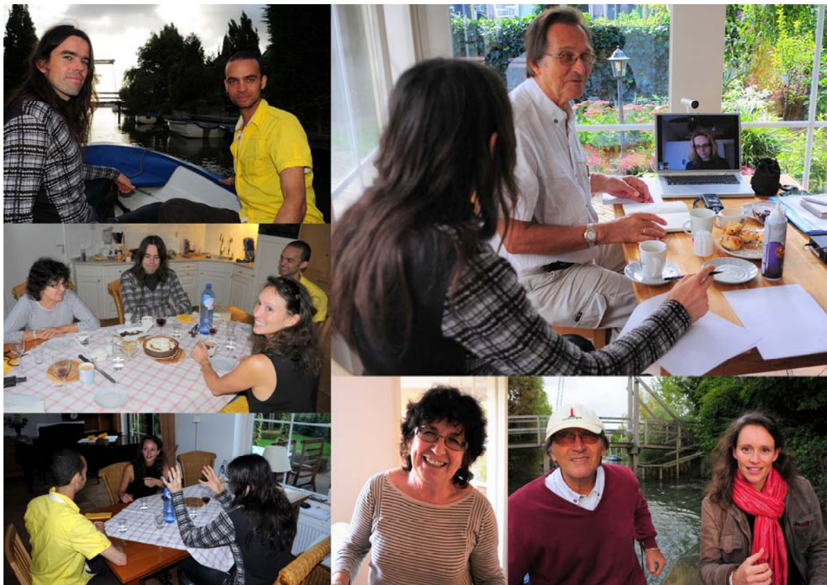
Images of the Lakeside Conversation on Collective Intelligence on September 13, 2009, in Lienden, The Netherlands.